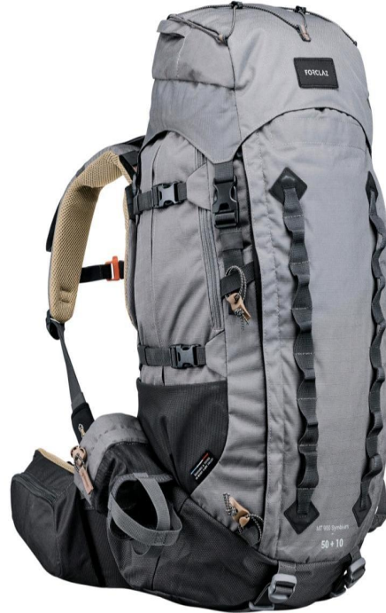
50+10 Liters Backpack