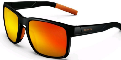
Cat 3 Sunglasses