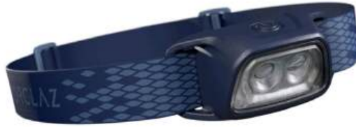
Head Lamp Rs. 200 (5D/4N)