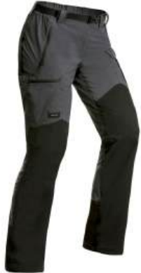
Water Repellent Pants Rs. 300 to 500 (5D/4N) According To Quality