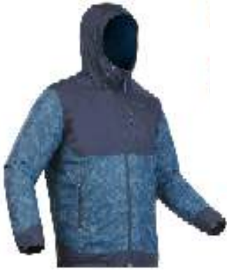
Waterproof Jacket Rs. 500 (5D/4N)