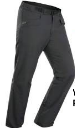
Warm Water Repellent Pants