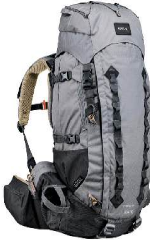
50+10 Liters Backpack With Waterproof cover