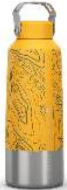
Thermal Water Bottle