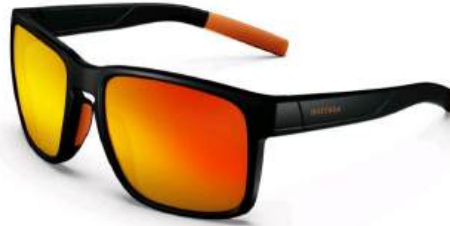
Cat 3 Sunglasses