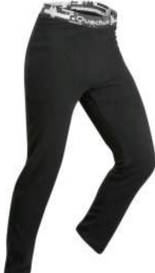
Fleece Inr Lower