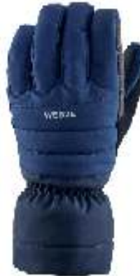
Waterproof Glove Rs. 200 (5D/4N)