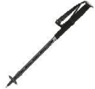
Trekking Pole Rs. 400 (5D/4N)