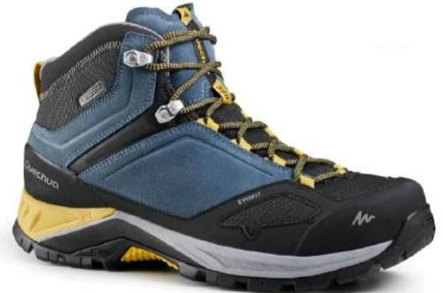
Waterproof Shoes Rs. 300 to 500 (5D/4N) According To Quality