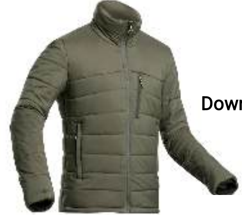
-5 ° Down Jacket